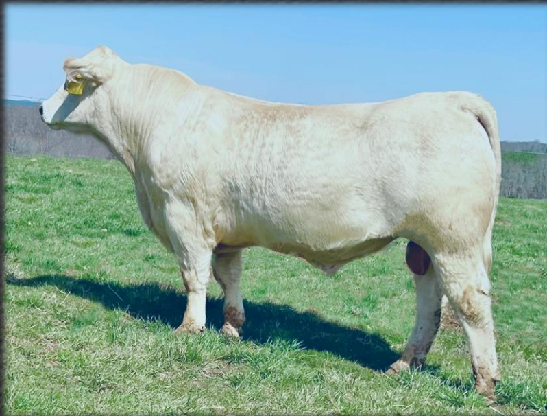
JMAR Kinsman 3J82 45 days after coming out of cows