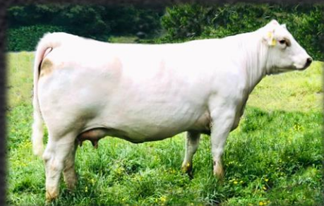
Fink Vanity 7548 dam of Lots 17 & 18

SCHURRTOP MIDWEST 2829 P SCHURRTOP CHANNEL 430Y P SCHURRGENE YANA H868 094R P