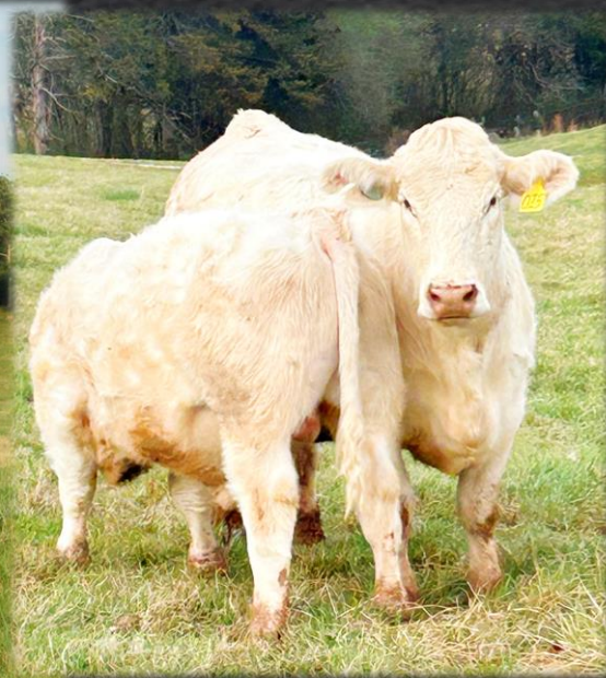
EC Victoria 025 nursing her Monticello bull calf this spring.