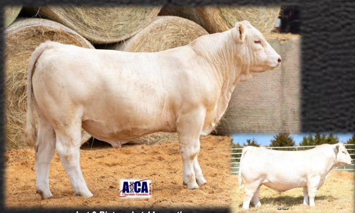
Lot 3 Pictured at 11 months

LT RUSHMORE 8060 PLD RBM KEYSTONE H41 RBM JASMINE F251