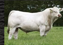
Silver Stream Padra P7

3 Conventional Embryos Silver Stream Padra P7 x EC Locklyn 865 Pld (Outcross Pedigree)