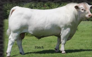
Pleasant Dawn Chisum 216A sire of Lot 18