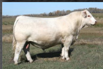
SVY Historic 241K

3 IVF Embryos - SVY Historic 241K x JMAR Ms Doubt 3E27 Exportable to Canada Guaranteed 1 pregnancy