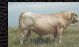
LT Blue Value7903 ET

3 Conventional Embryos LT Blue Value7903 ET x Eatons Miss Davidell 81268 P F1277034