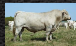
WCF Mr. Silver Gun 467

3 Conventional Embryos WCF Mr. Silver Gun 467 x EC Locklyn 865 Pld