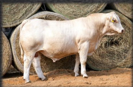
JMAR Kinsman 3J82 at 12 Months