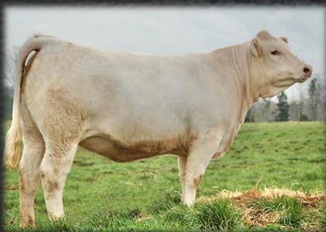
First daughter, DCR Ms Affinity H22 now at Testerman Charolais, WV

F136 was purchased from Doll Charolais in ND as a first calf heifer and has done nothing but generate herd sires and revenue since. She's the former #1 TSI female in the breed, dam of the $48,000 JMAR Jefferson 8M11 at ABS and the $31,750 JMAR Joshua 23M11 current herd sire for LG Herndon Farms in GA. She's generated well over $100,000 in progeny sales and is only 6 years old.