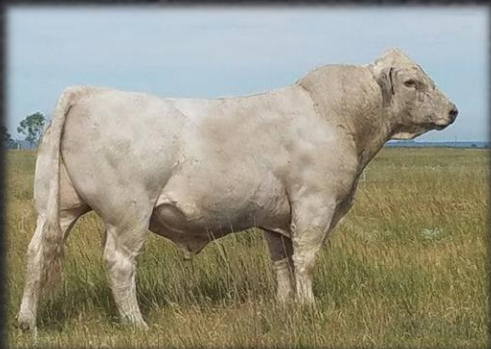
EC Done Deal 5052 Pld sire of Lot 9

A couple of years ago we went searching for an outcross carcass herd sire and soon found EC Done Deal 5052 Pld. Unfortunately, we soon learned he was deceased and there wasn't any semen. Therefore, we shifted our focus to the best Done Deal daughter we could find and ultimately landed on EC Dee Dee 652 to begin our Dee Dee cow family. She's the dam of current Eggleston Charolais herd sire EC Benaiah 652 Pld. She ratioed 117 on her first calf and 111 on her second prior to twins and moving into our donor program. She's been flushed once conventionally and froze 19 embryos. She's been IVF'ed once and froze 5 embryos, no FSH. Bred to FTJ Monticello 1806 on 11/14/2023 due 8/23/2024