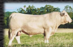
JMAR Jefferson 8M11

3 Conventional Embryos JMAR Jefferson 8M11 x EC Locklyn 865 Pld (Full Sib to LOT 16)