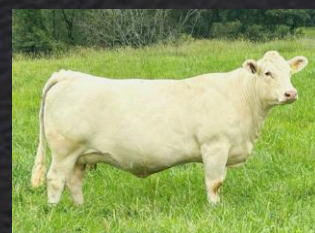
JMAR Ms Doubt 3E27

Tremendous opportunity to purchase Historic Embryos out of one of our best cows. These embryos are stored at Trans Ova in MD and can be shipped from there. These embryos are also listed under Lot 5 in the sale catalog.