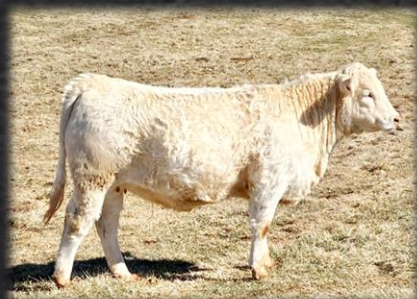
JMAR Nancy 7M81 daughter of Lot 6

The dam of our junior herd sire JMAR Kinsman 3J82. 2R88 is the carcass queen here at JMAR. Her first daughter scanned a 15 in ribeye and over 5% on IMF. Next, her son JMAR Kinsman 3J82 ratioed 126 for IMF among a pen of bulls who average in the top 1% for marbling. She descends from the prolific Nancy cow family who started with WCR MISS CENTURY 283, the dam of WCR MISS MAC IV 8501 and WCR MISS DUKE 8742, along with all the great sires and dams who descended from this line. If you believe in stacking great cows and cow families 2R88 is a female, you don't want to miss.