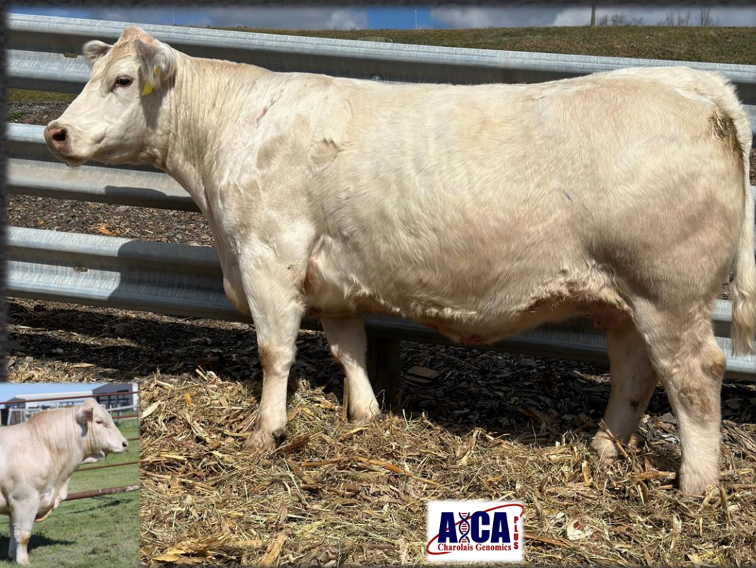
DC Grid Topper son of Lot 15