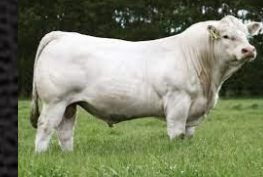
Silver Stream Padra P7

3 Conventional Embryos Silver Stream Padra P7 x Eatons Miss Davidell 81268 P F1277034