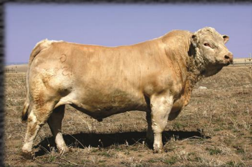
MD Sentinal Ruler G1520 Service Sire of Lot 13

Outcross and former #1 Marbling bull in the breed. Currently he's a 16.6 CE, -2.1 bw and .58 marbling.